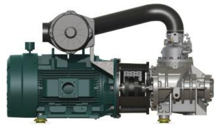
Variable Speed Direct Drive

The VSD also integrates numerous power monitoring and fault protection technologies, such as: Integrated EMC filter, line reactor, phase loss and overload protection.